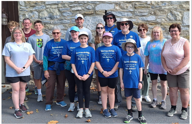
This year's team of 20 Atonement walkers raised $1,270.78 . Thank you to all who walked or donated!