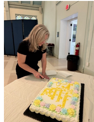
September 15 Pancake breakfast raised $935 for ELCA World Hunger

Atonement Lutheran Church 5 Wyomissing Boulevard, Wyomissing, Pennsylvania 19610 Phone: 610-375-3512 | www.atonementwyo.org