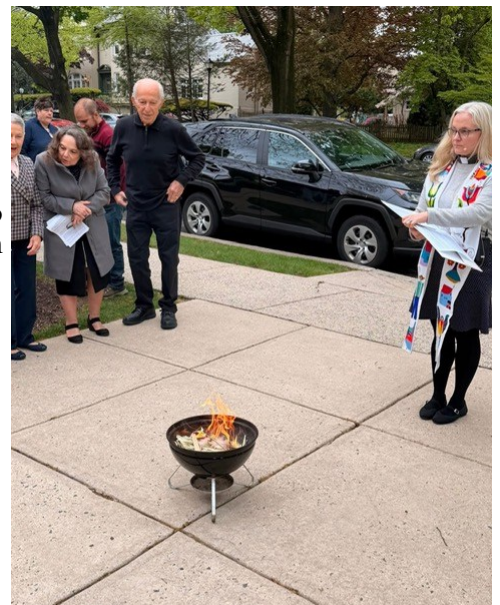
The burning of the mortgage during worship Sunday, April 26

There are many different ways to give to Atonement and we would be glad to provide guidance on what types of gifts and assets are accepted. Please reach out to the church office if you have any questions.