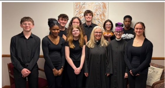
Participants in Good Friday Youth Drama

5 Wyomissing Boulevard, Wyomissing, Pennsylvania 19610 610-375-3512