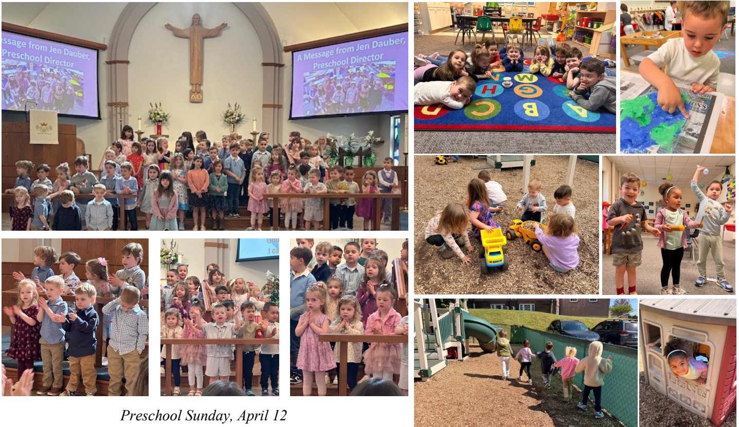
Preschool Sunday, April 12