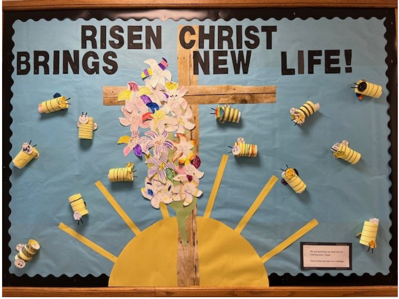
If you haven't seen it—stop by the Sunday School bulletin board to read a special message about Jesus!

**NO FAITH FORMATION FOR CHILDREN ON MOTHER'S DAY, MAY 12**