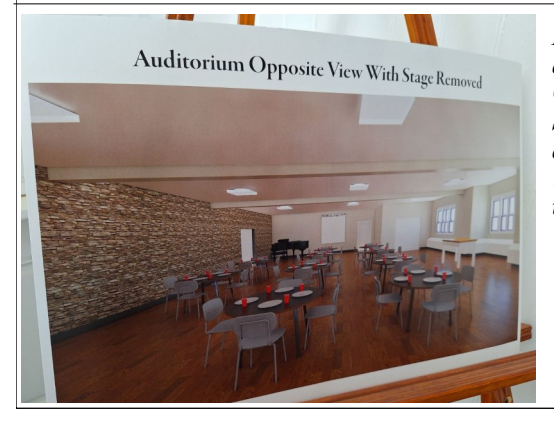
Left: a sneak peek at the remodeled Common Ground Sunday worship and meal space at Trinity, currently under construction.