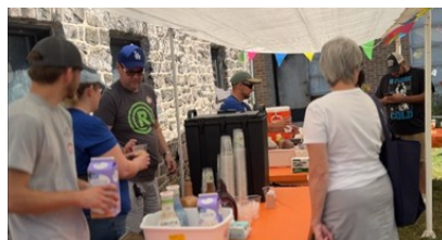
West Reading Fall Fest—September 2025