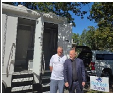
Shower Trailer/Refresh Berks—September 2025