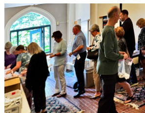
Shower Kit Assembly—September 2025