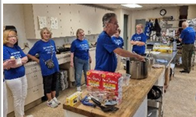
Pancake Breakfast—September 2025

Coming in December: Our first (but not last) cookie extravaganza with many of you baking cookies for us to distribute again to those less fortunate than ourselves.