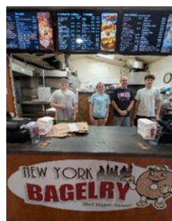
New York Bagelry—Weekly Donation