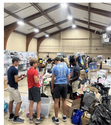
Sorting clothes at Mary's Shelter

Atonement Lutheran Church 5 Wyomissing Boulevard, Wyomissing, Pennsylvania 19610 Phone: 610-375-3512 | www.atonementwyo.org