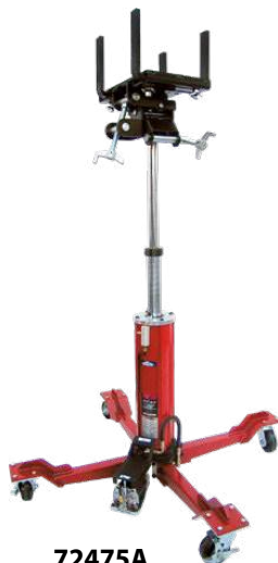
3/4 Ton Capacity