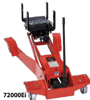
1-1/2 Ton Capacity