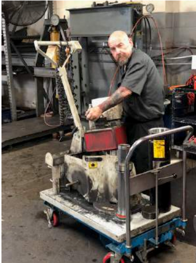
Specialty Equipment Repairs