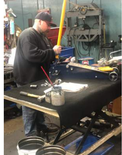
Floor Jacks Repairs