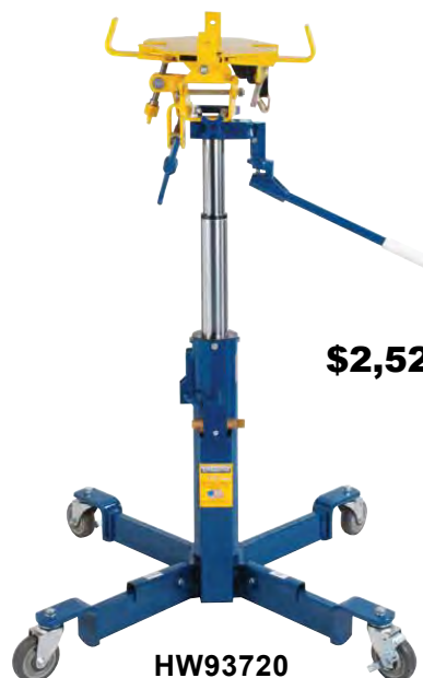
1,000 lbs Air/Manual Telescopic Trans Jack