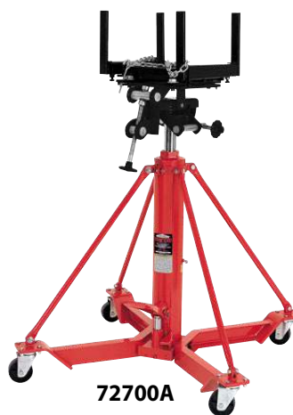
1 Ton Capacity