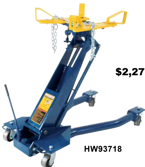
1 Ton Floor Transmission Jack