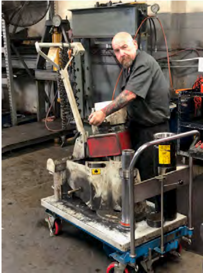
Specialty Equipment Repairs