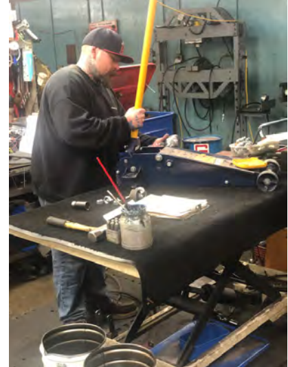
Floor Jacks Repairs