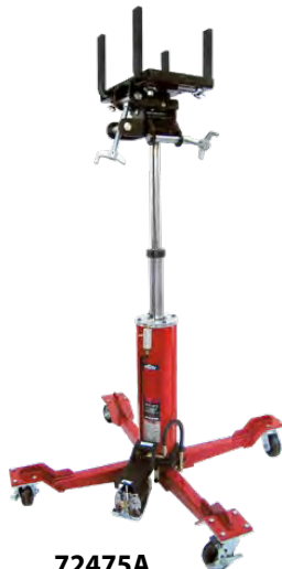
3/4 Ton Capacity