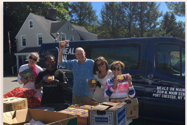
A delivery from Meals on Main

In addition, we continue to receive donations from many individuals in Somers and the surrounding communities, as well as the local DeCicco's. Since 2020 Heritage Hills has