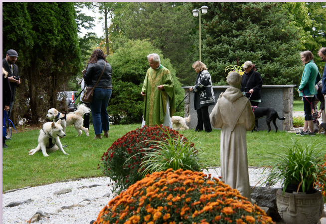
Blessings continued outside in the St. Francis Memorial Pet Garden