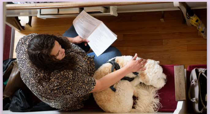
Pups in the pews