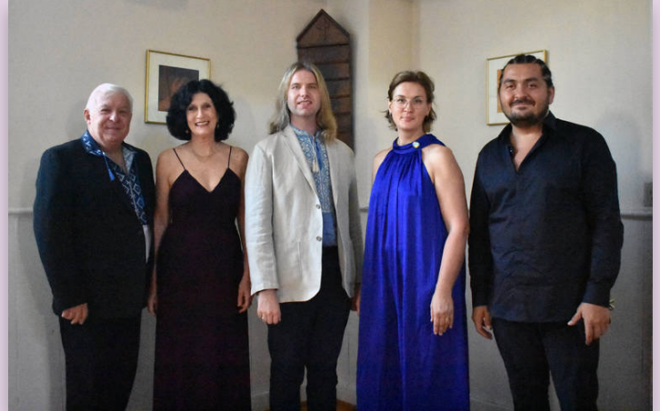
Performers from the Ukraine benefit concert

The July benefit concert for Ukraine featured world class pianists and singers, generous donations, and a happy “standing room only” crowd.