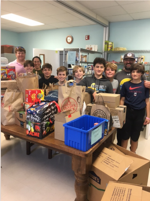
Somer's PTA Fall Drive

sponsored semi-annual food drives for us, and in October the Pickleball players initiated an additional drive. Plus, we received a bounty of late summer produce from the Heritage allotment gardeners. Somers Library included us as a beneficiary of their "Kindness Week" outreach project. Somers PTA, always a staunch supporter, delivered the proceeds of a "back to school" food drive. We anticipate another generous Thanksgiving donation from Somers Middle School's PTA, students, clubs and scouts.