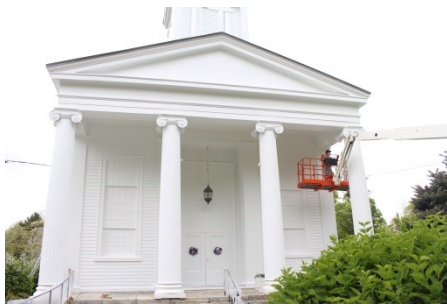
Painting in progress