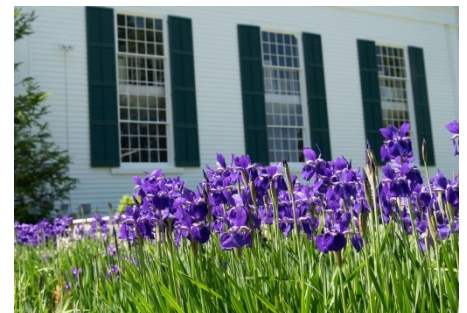
Where we are now