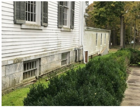
Where we started