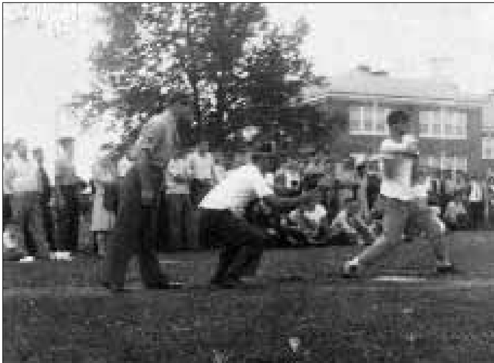
At bat in a game behind the old high school in 1946.