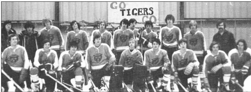
The Ridgefield High School hockey team in 1974.