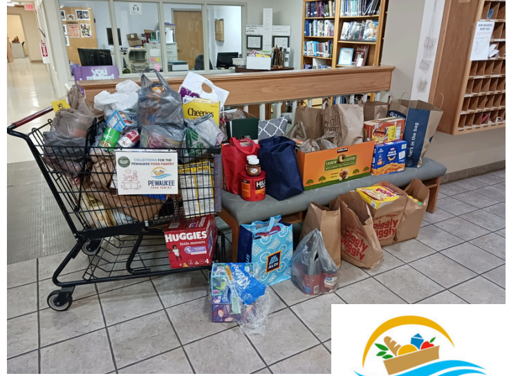
Nov. Food Pantry Donations!

Top 10 (ranked by # of Registrants & by $$ of Donations)