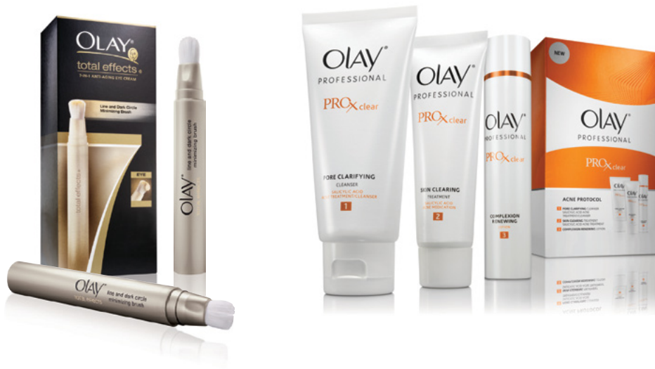
Olay Photography, illustration for DraftFCB