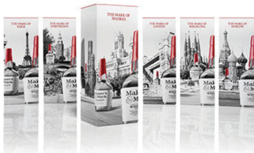
Photography, Illustration for Beam Suntory POS