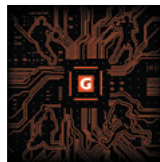
Gatorade South by Southwest pop-up pavilion and store experience for MKTG