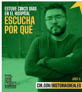
Vax-Chi-Nation, City of Chicago Covid Response Outreach

Adobe Creative Cloud, including InDesign, Photoshop, Illustrator, and Acrobat, Microsoft Office Suite, Google Docs, and Slides, Color Fidelity, Pre-flight, Examples, Mock-Ups, Final Output