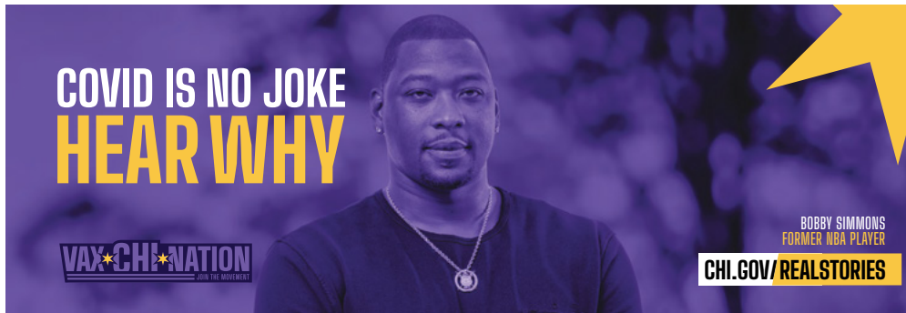
Vax-Chi-Nation, City of Chicago Covid Response Outreach