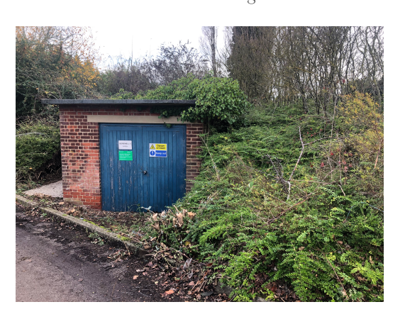
All areas were scanned using CAT / SGen equipment and marked out with paint / flags