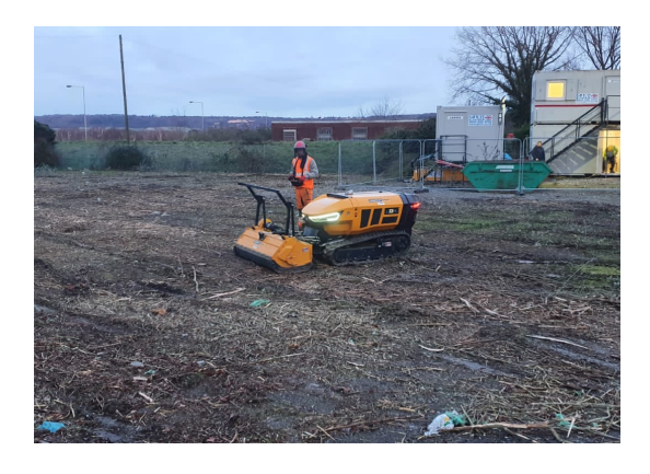
A remote forestry mulcher clearing fence lines