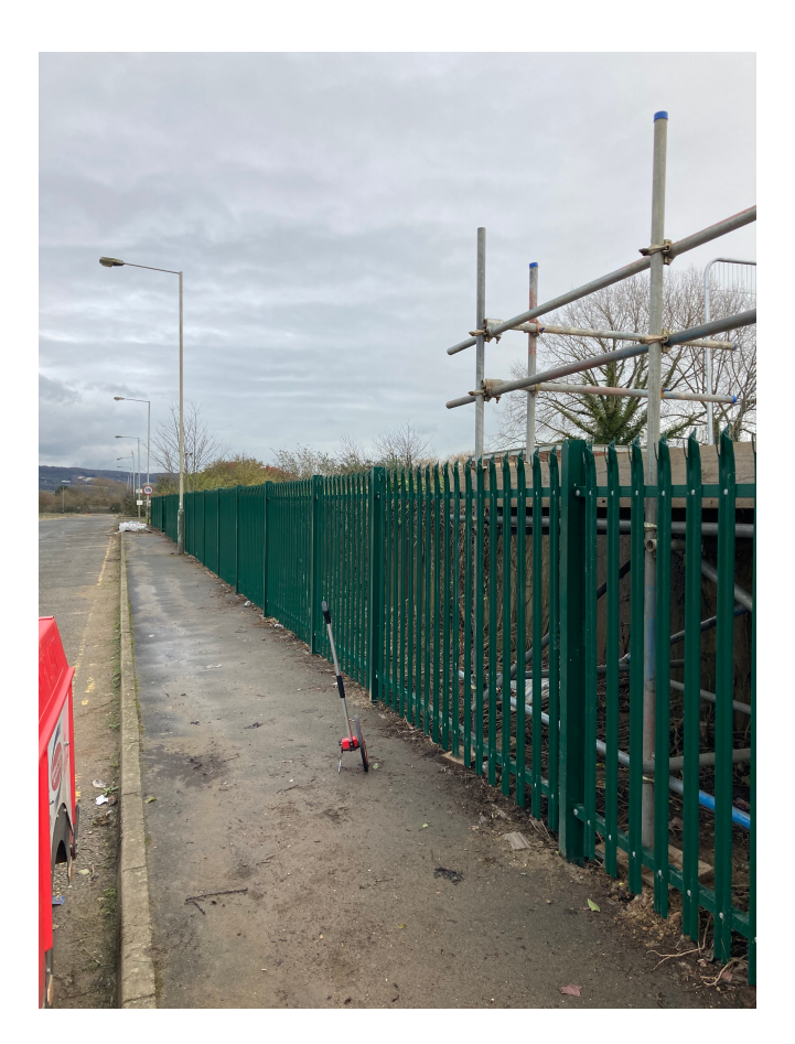
All measurements were checked, agreed with the client prior to invoicing.