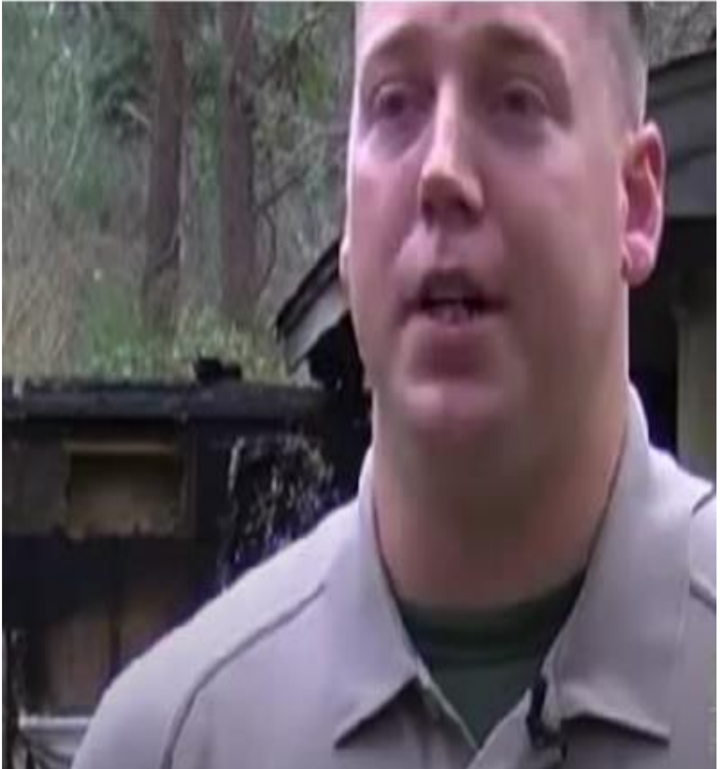
EXHIBIT 2 RANKIN COUNTY SHERIFF HUNTER ELWARD BLACK LAWYERS FOR JUSTICE