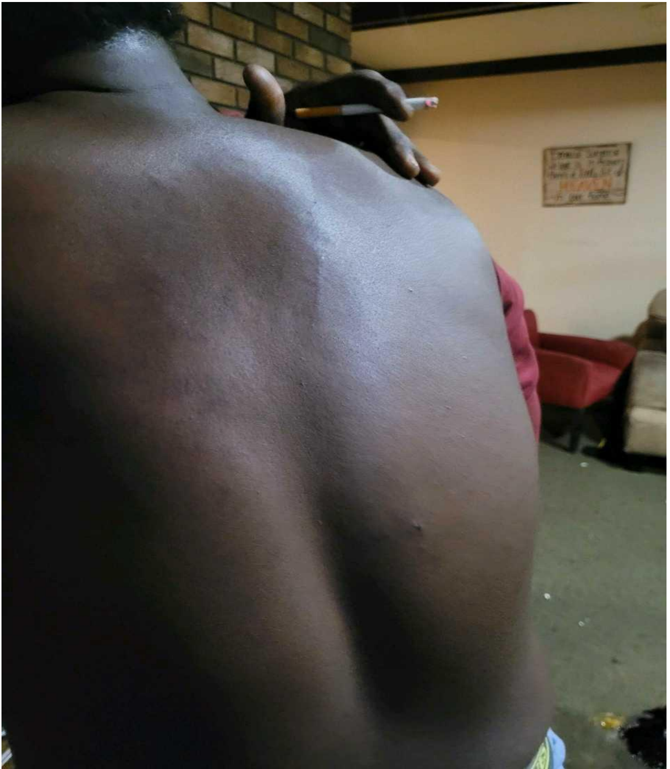
EXHIBIT 11 Eddie Parker BLACK LAWYERS FOR JUSTICE