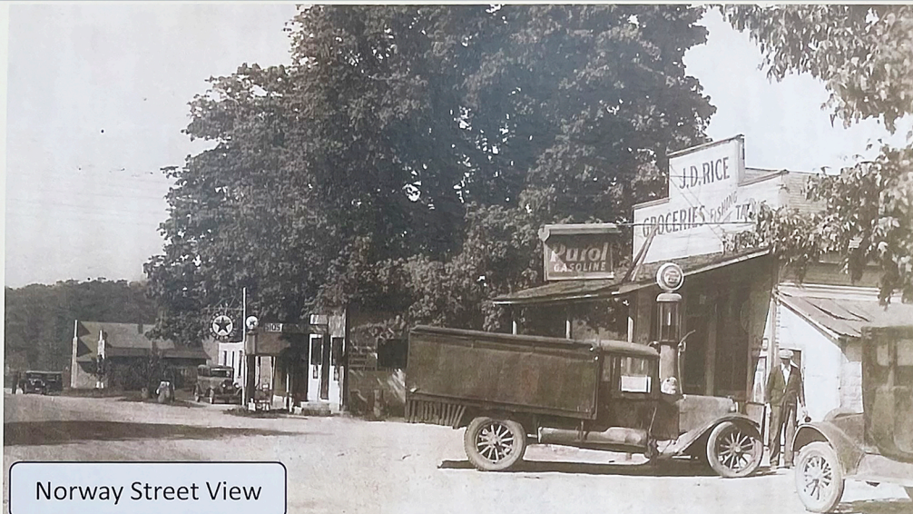
Norway Street View