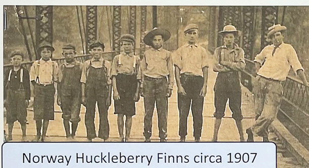
Norway Huckleberry Finns circa 1907