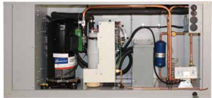
DUAL COOLED 5 TON MODEL SHOWN