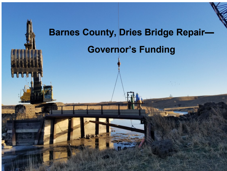
Barnes County, Dries Bridge Repair— Governor's Funding