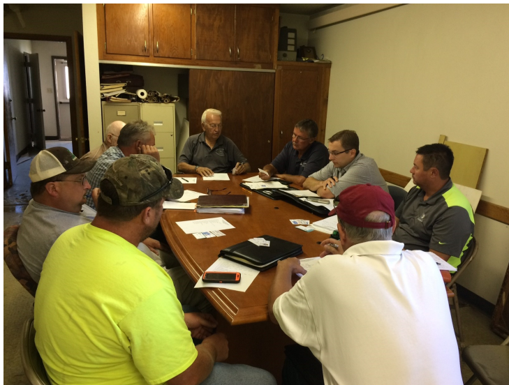
City of Wimbledon Stand Pipe Replacement— Governor's Funding Pre-construction Meeting