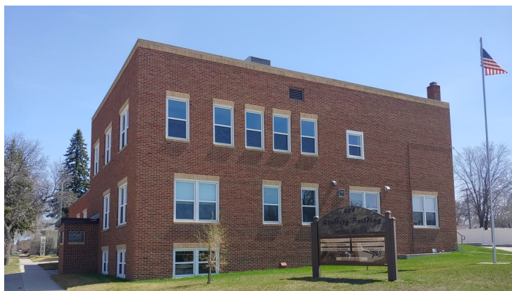
Above: New Location!

South Central Dakota Regional Council Staff