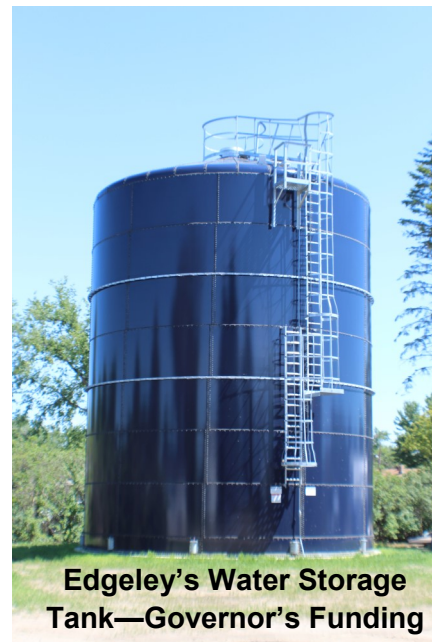
Edgeley's Water Storage Tank—Governor's Funding