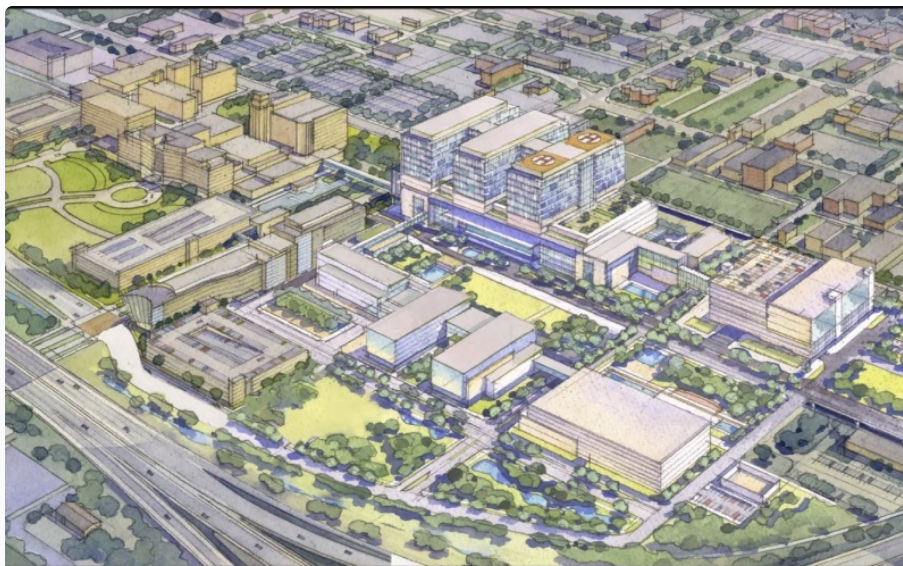
Indiana University Health new hospital campus View looking Northeast from Southwest