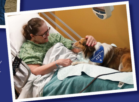
A Pet Encounter Therapy (P.E.T.) visit.