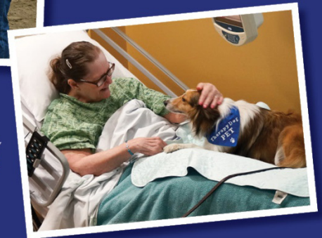
A Pet Encounter Therapy (P.E.T.) visit.