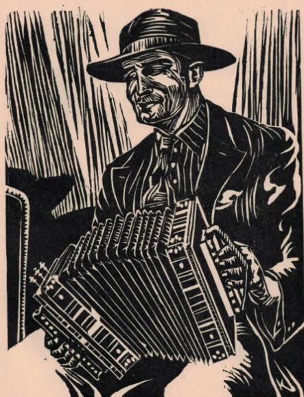
FEAR AN CÉOL