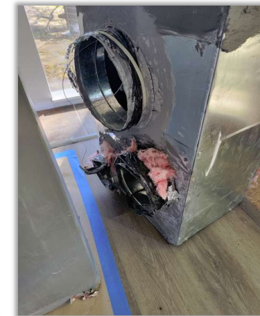
Part of what we had to remove and haul off.