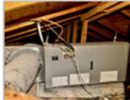
This was the 3 ton unit they installed, the metal straps are broke and it is sitting on the ceiling joist. The drip pan under it was full when we finally found it.