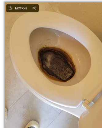
This is how they left the master bath toilet. The cleaner said it was caked up and very thick with mold, must have sat that way for months.