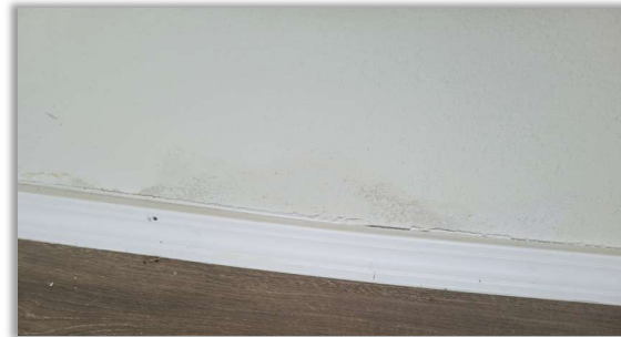
Freshly painted wall left this way. There were several such places.