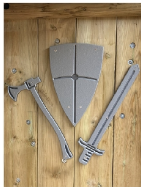
Under Deck Armoury