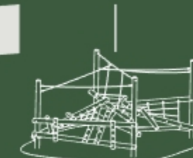
Clamber Stack Piccolo, Mezzo, Midi & Fratello