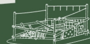
Clamber Stack 4, 5 & Passo