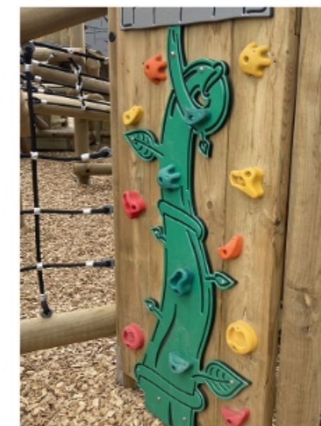
Beanstalk Climb Wall