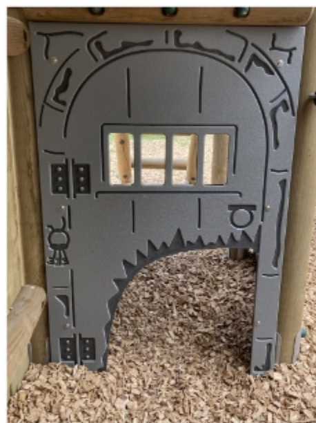
Under Deck Dungeon