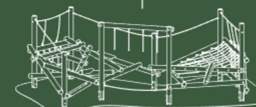
Clamber Stack Figlio, Zio & Zietta