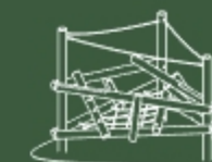
Clamber Stack 1, 2 & 3