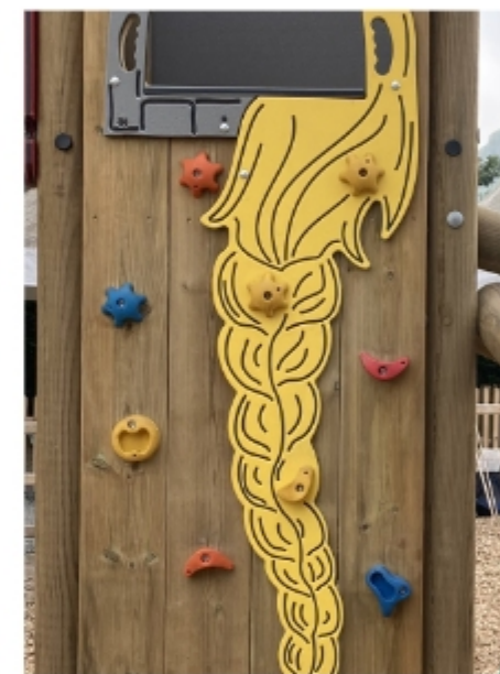
Rapunzel Climb Wall