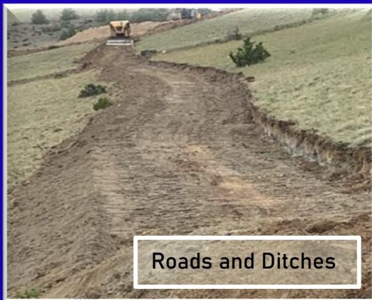
Roads and Ditches