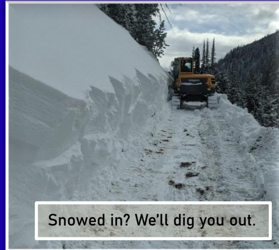
Snowed in? We'll dig you out.