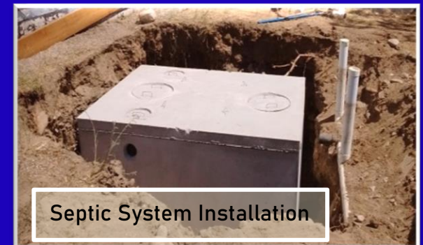
Septic System Installation