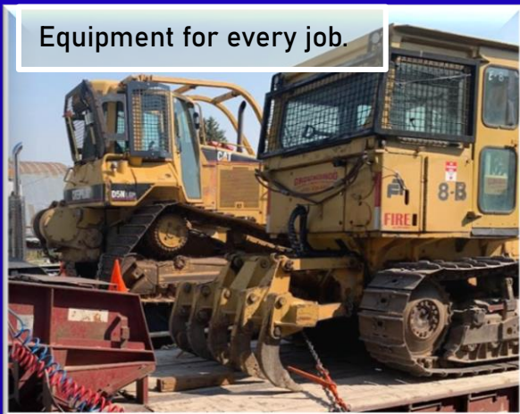
Equipment for every job.

Groundhog Mining & Milling Co., LLC is experienced with working on ditches and roads. Depending on the season, your needs may vary; whether you need plowing and grading, drainage repair or installation, or need a road constructed, we have the equipment and experience you will depend on for every job.