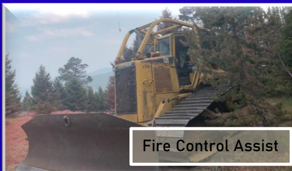
Fire Control Assist

No matter what size project, Groundhog has the equipment and capabilities to accomplish it. We'll assist you in everything: obtaining permits, passing inspections, excavating the structure or area, hauling away debris, reclamation of the land for your next use, prepping leveling and pouring a new foundation, the final clean-up of the site, and whatever else you need done. We're committed to safe and exceptional results.