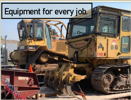
Equipment for every job.

Groundhog Mining and Milling Co. is experienced with working on ditches and roads. Depending on the season, your needs may vary; whether you need plowing or grading, drainage repair or installation, or need a road constructed, we have the equipment and experience you will depend on for every job.