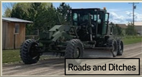
Roads and Ditches