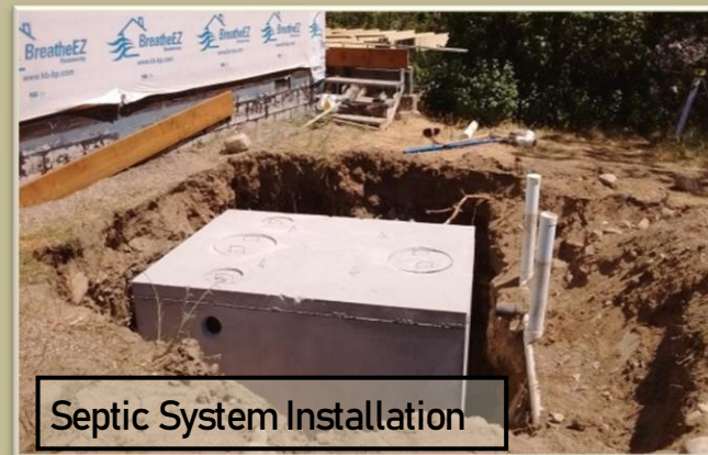
Septic System Installation