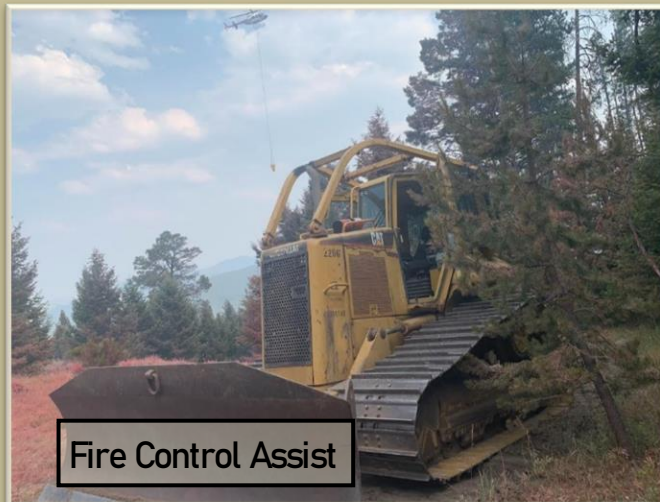
Fire Control Assist

No matter what size project, Groundhog has the equipment and capabilities to accomplish it. We'll assist you in everything: obtaining permits, passing inspections, excavating the structure or area, hauling away debris, reclamation of the land for your next use, prepping, leveling and pouring a new foundation, the final clean-up of the site, and whatever else you need done. We're committed to safe and exceptional results.