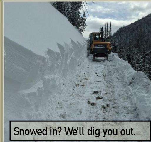
Snowed in? We'll dig you out.