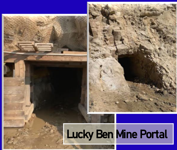
Lucky Ben Mine Portal