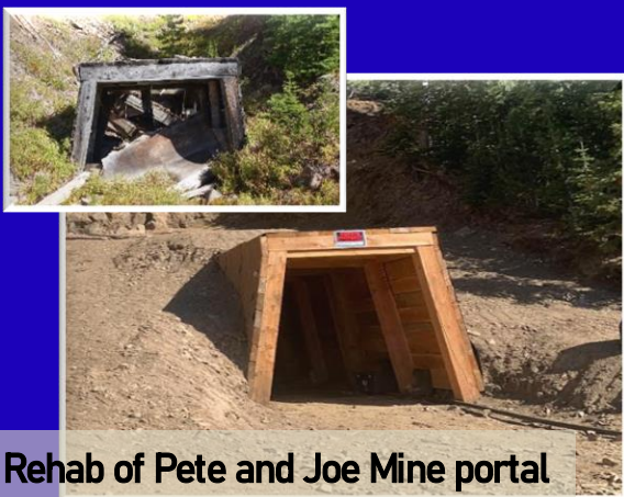
Rehab of Pete and Joe Mine portal