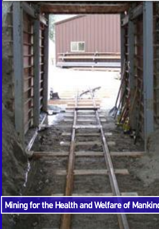
Mining for the Health and Welfare of Mankind

GROUNDHOG EXCAVATING & MINING CONTRACTORS