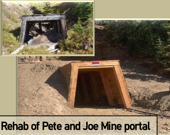
Rehab of Pete and Joe Mine portal

We are able to work with you, the state, and federal entities to prepare your permits and ensure your good standing reputation with all governing authorities.