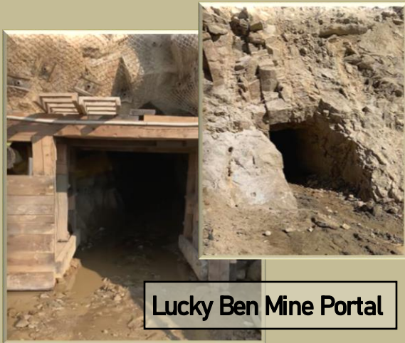
Lucky Ben Mine Portal