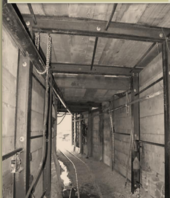
Mining for the Health and Welfare of Mankind