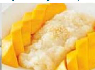
Mango Sticky Rice