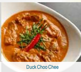
Duck Choo Chee