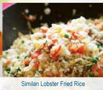
Similan Lobster Fried Rice