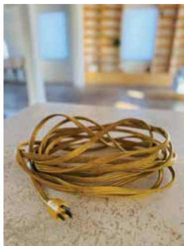
One extension cord