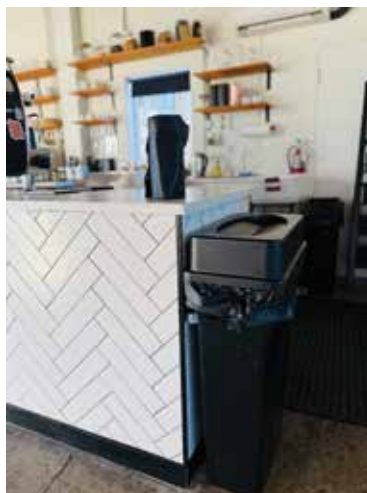
Three trash cans, plenty of trashbags always stocked