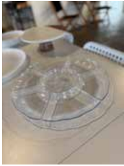
Clear Plastic Serving Platter