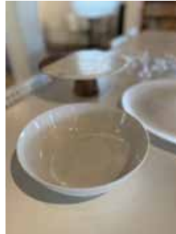
White Ceramic Bowl