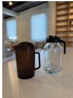
One plastic, one glass pitcher