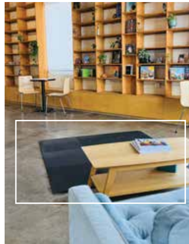
Square foam connecting mats - 12 total 9 pictured