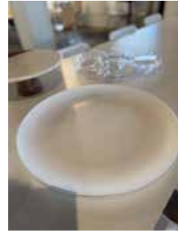
White Plastic Serving Platter