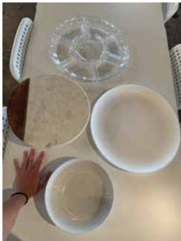
*For size reference