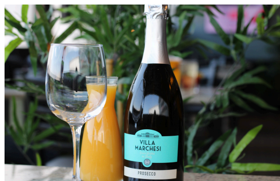
Brunch Specials served Saturday, Sunday & Holiday Mondays until 2:00pm

VILLA MARCHESI PROSECCO $25/750ML Make it a mimosa! add 9oz of orange juice $3