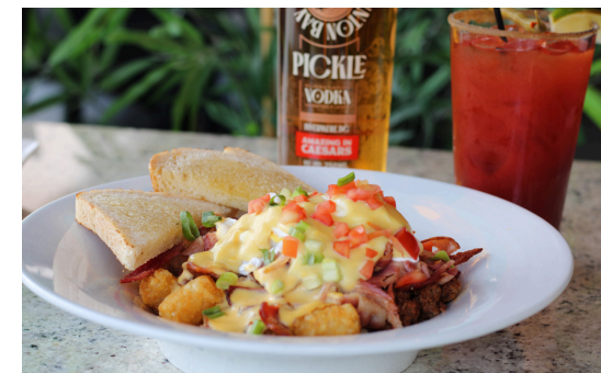
Brunch, the socially acceptable excuse for day drinking.