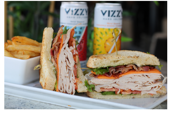
PRIME RIB BEEF DIP $22.25 Mushrooms, swiss cheese & horseradish mayo, au jus

TURKEY CLUB STACK Shaved turkey, bacon, cheddar, lettuce, tomato & mayo piled high between 2 pieces of sourdough