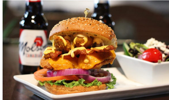
Our breaded chicken burger topped with cheddar, bacon, jalapeno poppers & zesty cheese sauce!