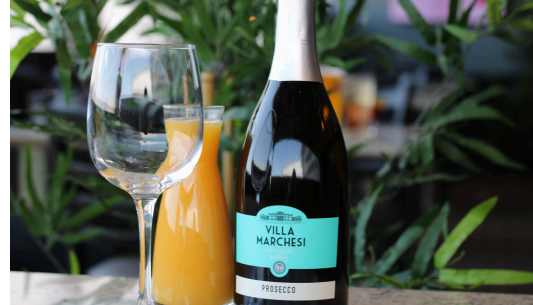
Daily Specials are Subject to Special Events