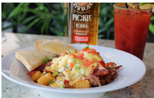
Brunch, the socially acceptable excuse for day drinking.