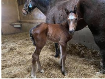
Territories x Melody Of Love Filly