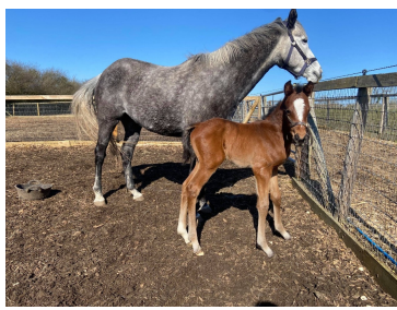
Zoffany x Love's Secret Colt