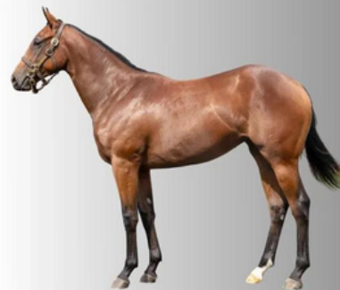
TWILIGHT SON X SWEET AND DANDY