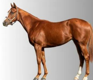
TORONADO X LUCKY LOT