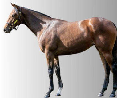
HAVANA GOLD X STELLA BLUE