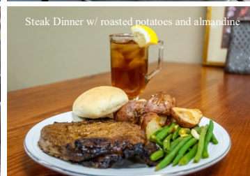
Steak Dinner w/ roasted potatoes and almandine