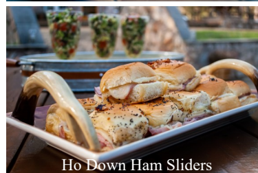
Ho Down Ham Sliders