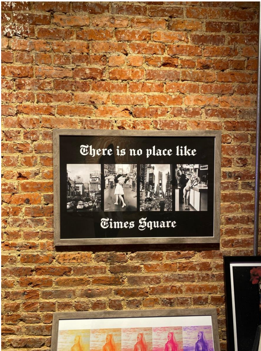
"TOURIST TRAP" $900