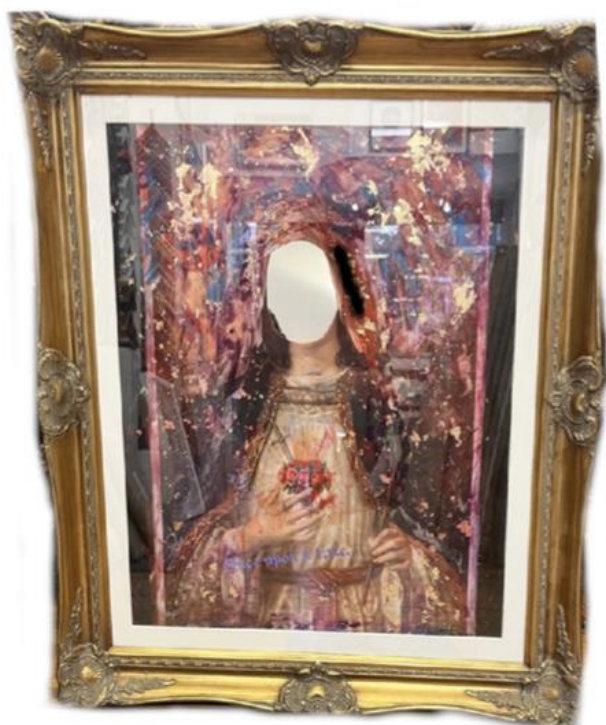
“BORN AGAIN VIRGIN” 2022 $8500