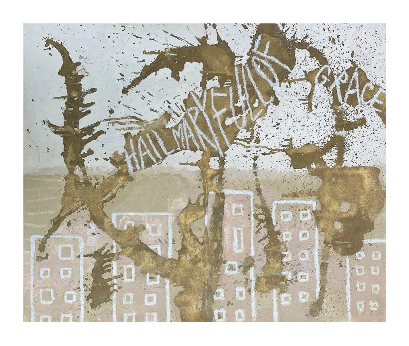
HAIL MARY, 2022 Mixed media on canvas, 35 X 29 inches $999