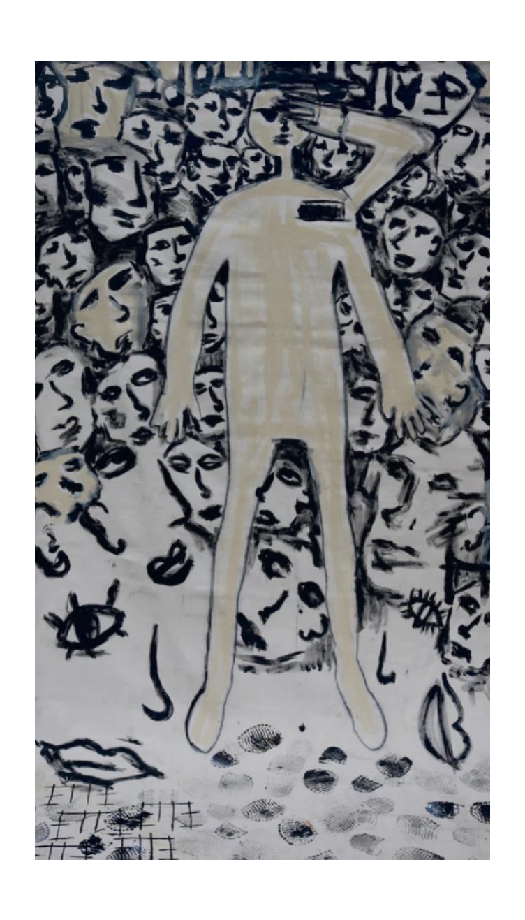
MAN, 2018 Acrylic on canvas, 9.75 feet X 62.5 inches $9,999