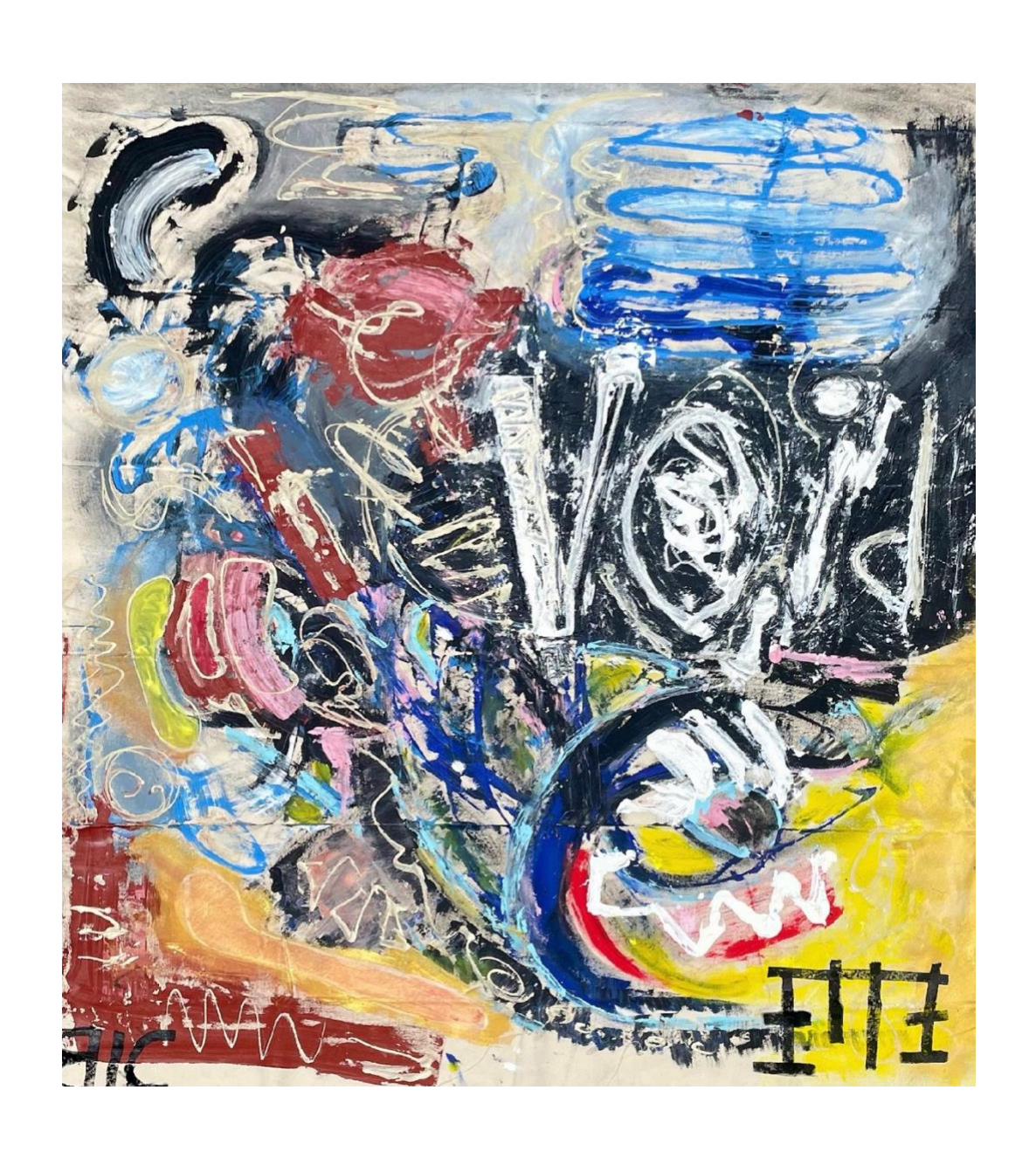
VOID, 2022 Mixed media on canvas, 42 X 42 inches $6,000