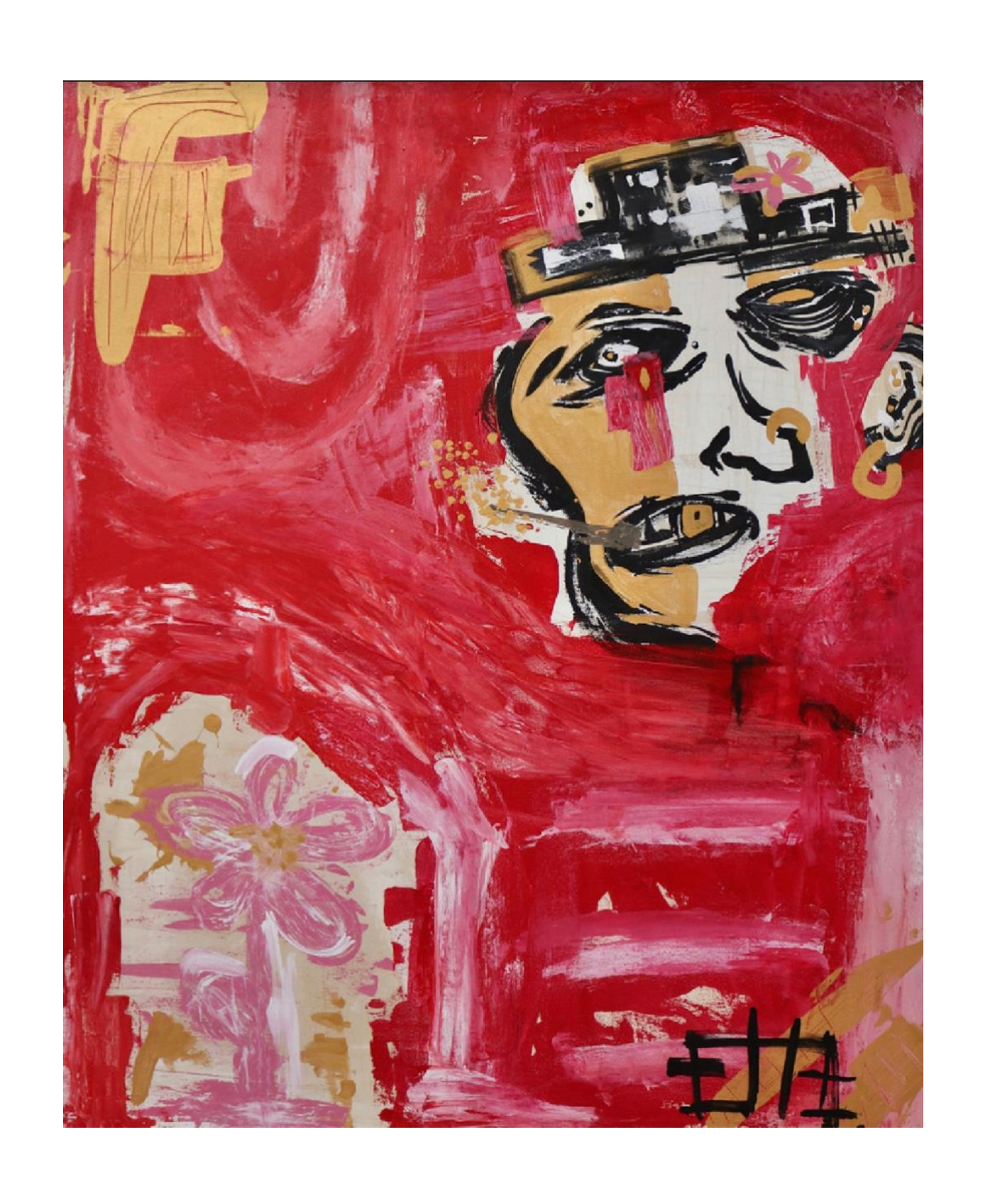
THE GARDENER, 2022 Acrylic on canvas, 55 X 60 inches $3,999