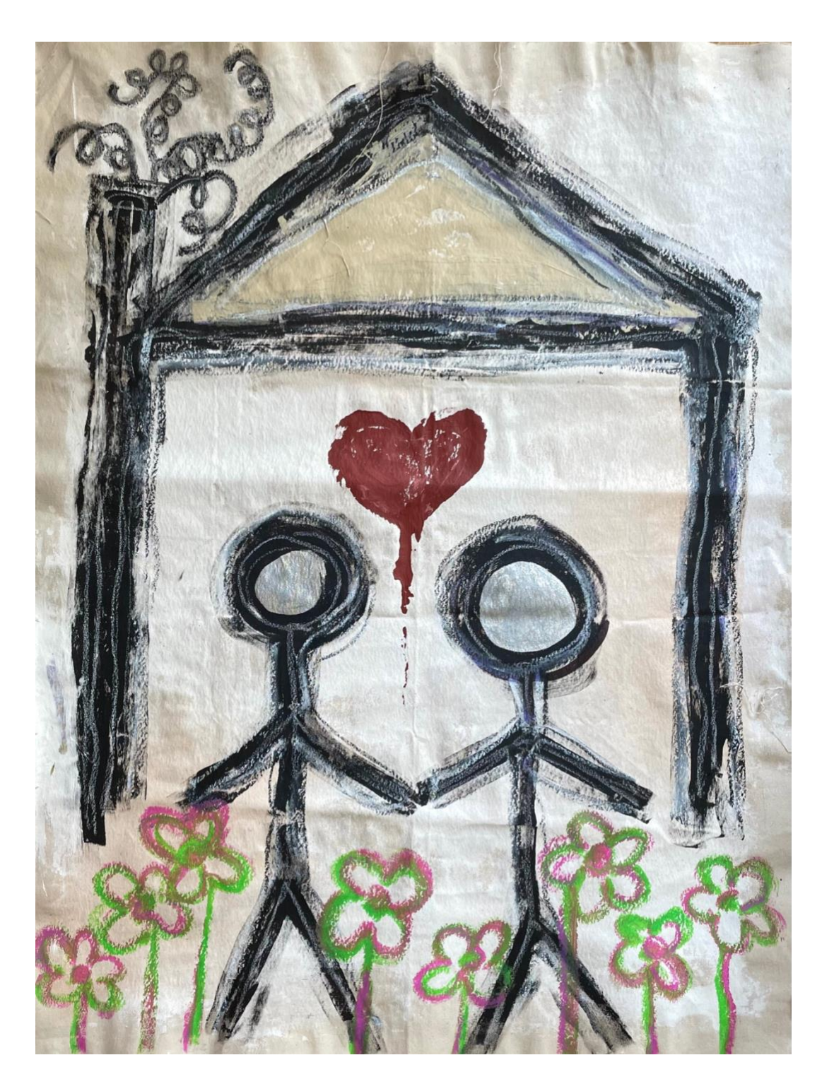
HOME acrylic and oil on canvas