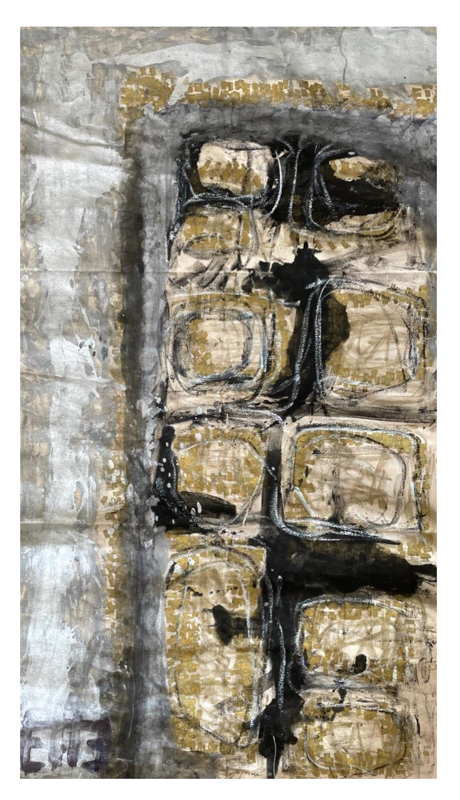
INDUSTRIAL oil, ink, acrylic on canvas size: 30 x 53.5in price: $3,500