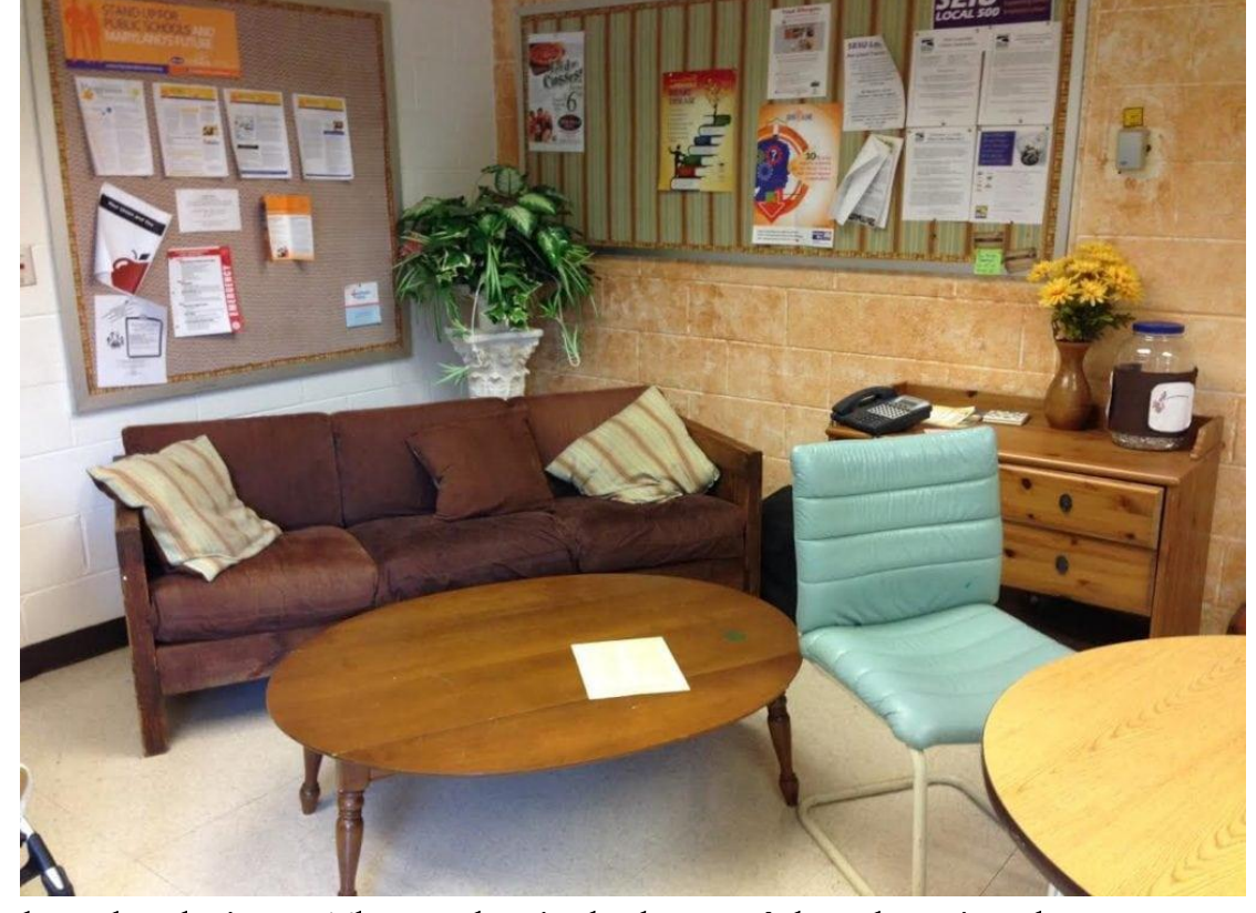
Everyone who remembers his own education remembers teachers, not methods and techniques. The teacher is the heart of the educational system