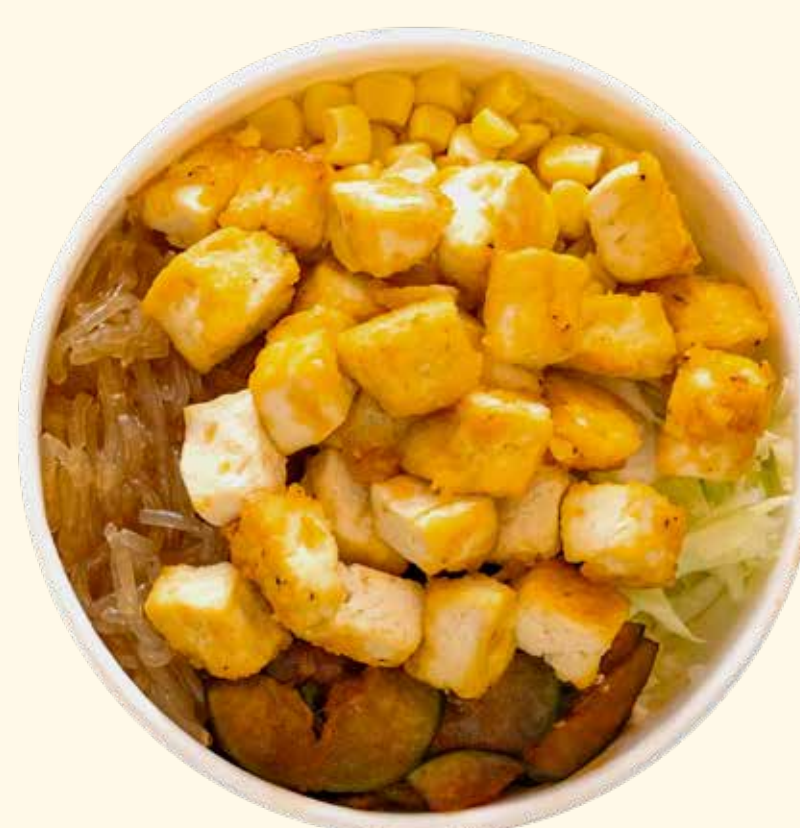
Tofu DupBop 🌱