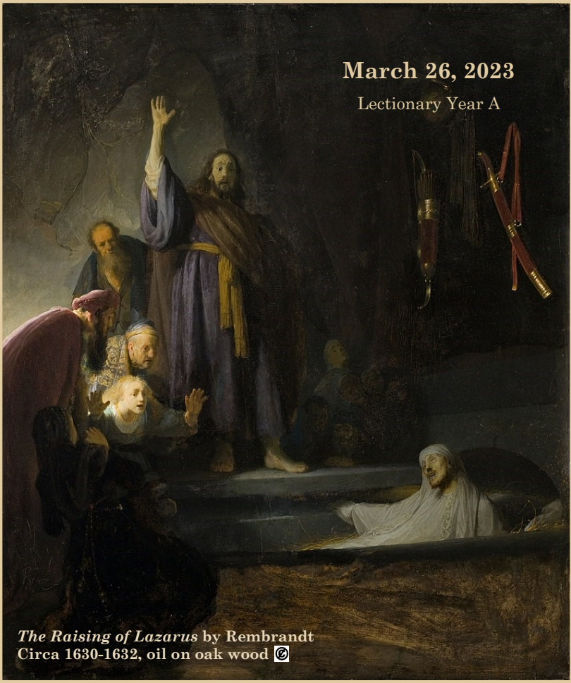
The Raising of Lazarus by Rembrandt Circa 1630-1632, oil on oak wood