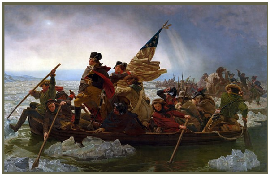
Washington Crossing the Delaware by Emanuel Leutze, 1851, oil on canvas

Words: Samuel Francis Smith (1808-1895) Music: America from Theaetna Musica , 1745