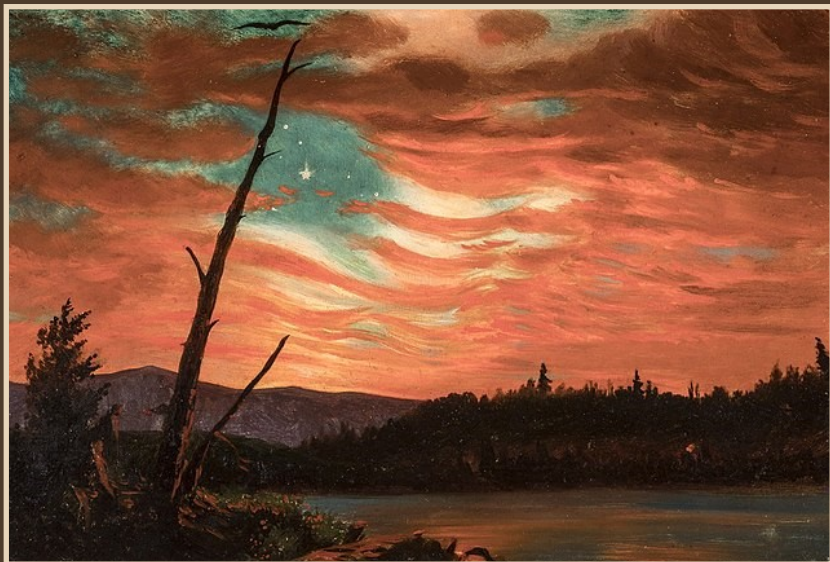
Our Banner in the Sky by Frederic Edwin Church, 1861 ©