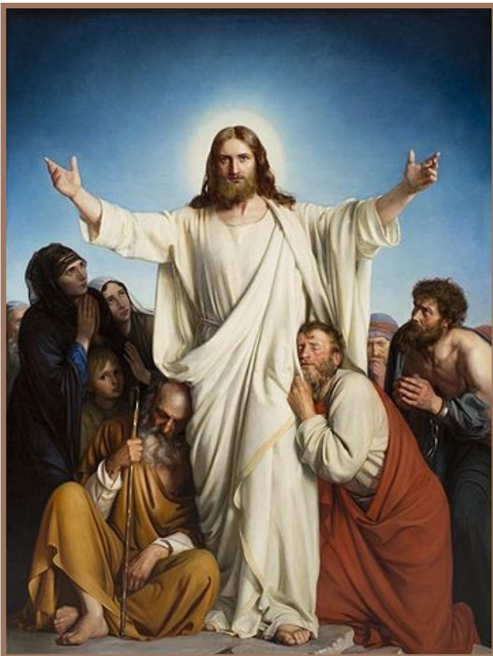
Christ the Consolator by Carl Bloch, by 1890 ©