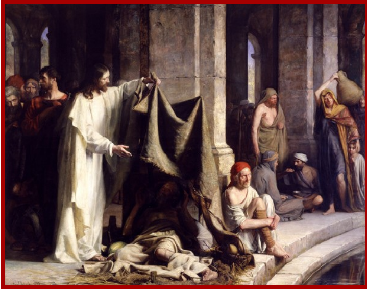
Christ Healing the Sick by Carl Bloch, 1883 ©