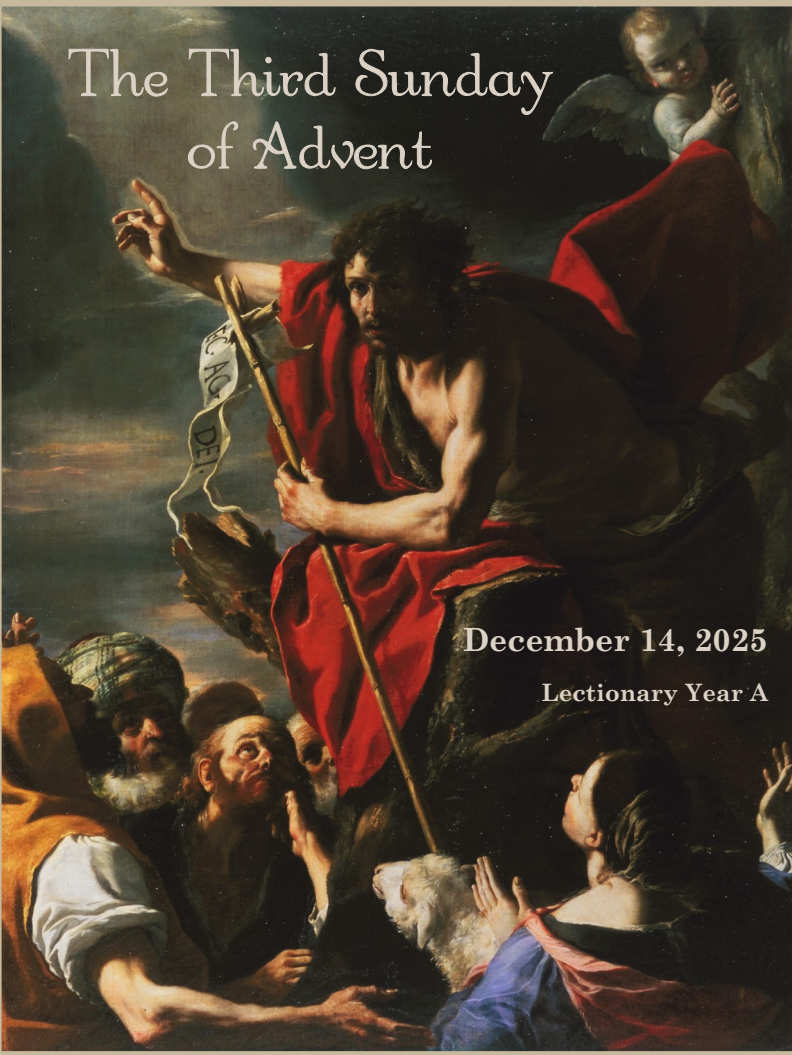
John the Baptist Preaching by Mattia Preti, circa 1665, oil on