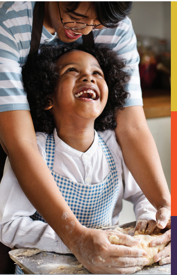
California Home Warranty Plan homewarranty.com 1-800-TO-COVER

Fidelity National Home Warranty helps manage and protect your home expenses with protection plans that cover major systems and appliances. Whether you are a home buyer or home seller, a home warranty is a very affordable way to protect your most valuable asset! It is the type of investment that pays for itself. There is simply no substitute.